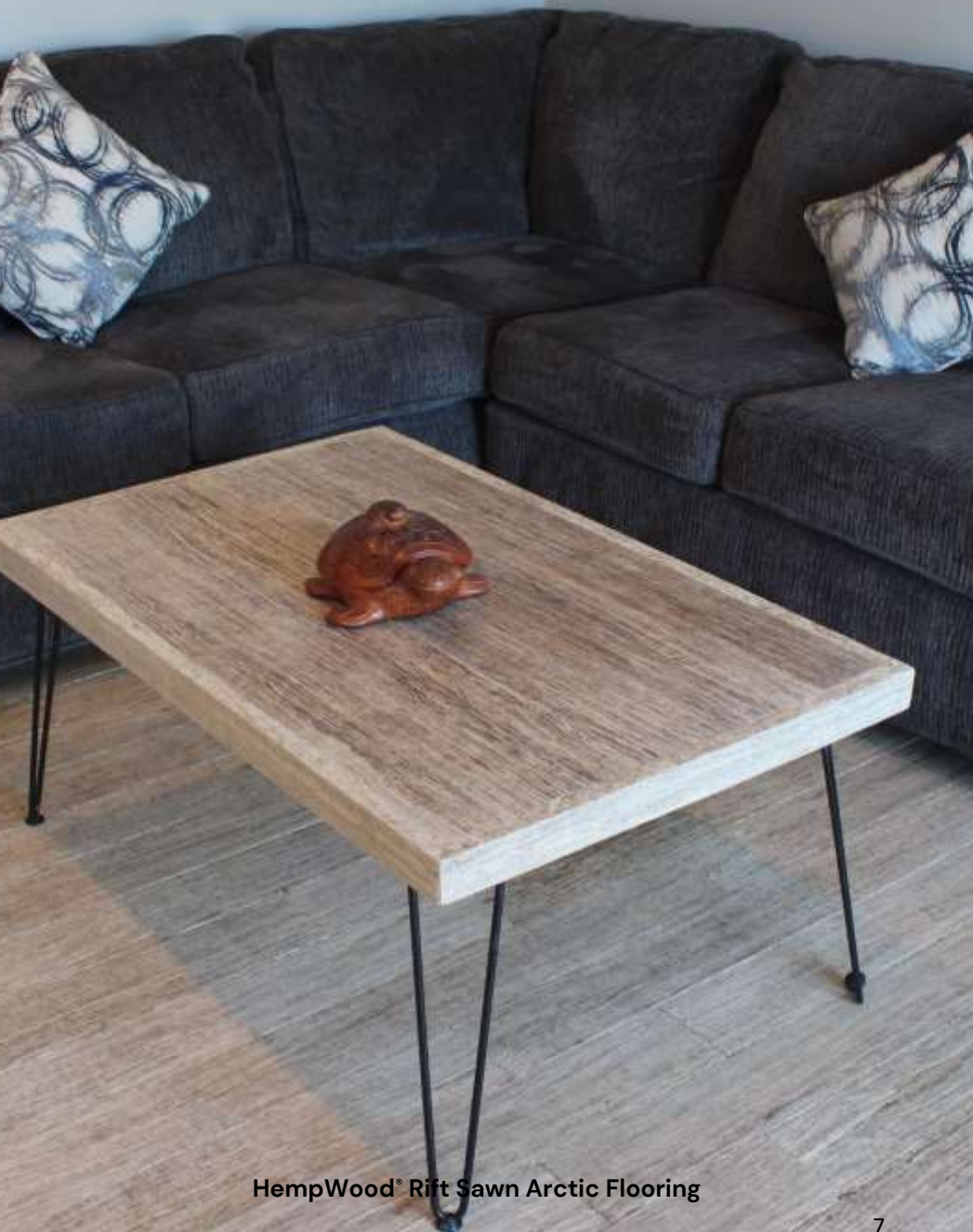
HempWood® Rift Sawn Arctic Flooring