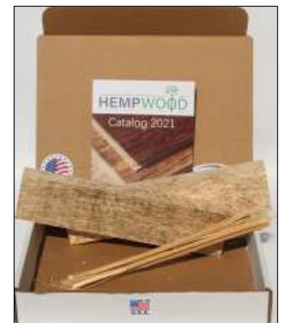
Lumber Sample Pack