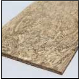
1/4 x 5.25 x 48/72" $2.50/linear ft.