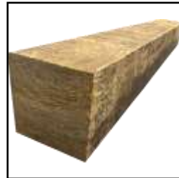
6 x 6 x 48/72" $30/linear ft.