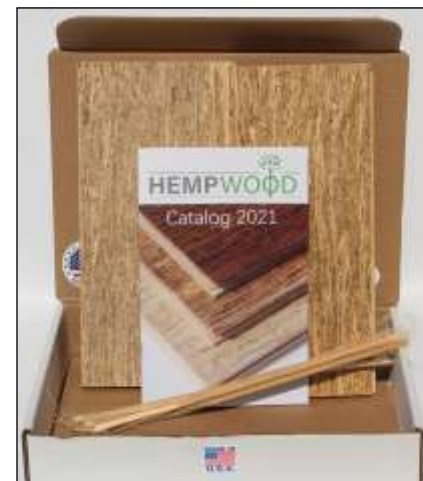
Flooring Sample Pack