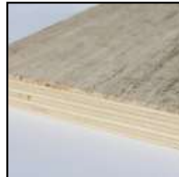
$25 1 x 10 x 48" $120 1 x 48 x 48" $240 1 x 48 x 96"