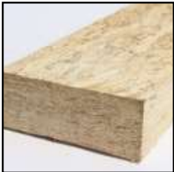
8/4 x 5.25 x 48/72" $10/linear ft.