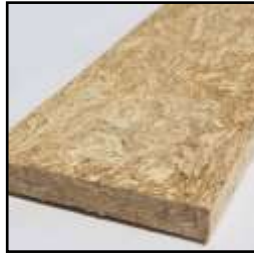
3/4 x 5.25 x 48/72" $6/linear ft.