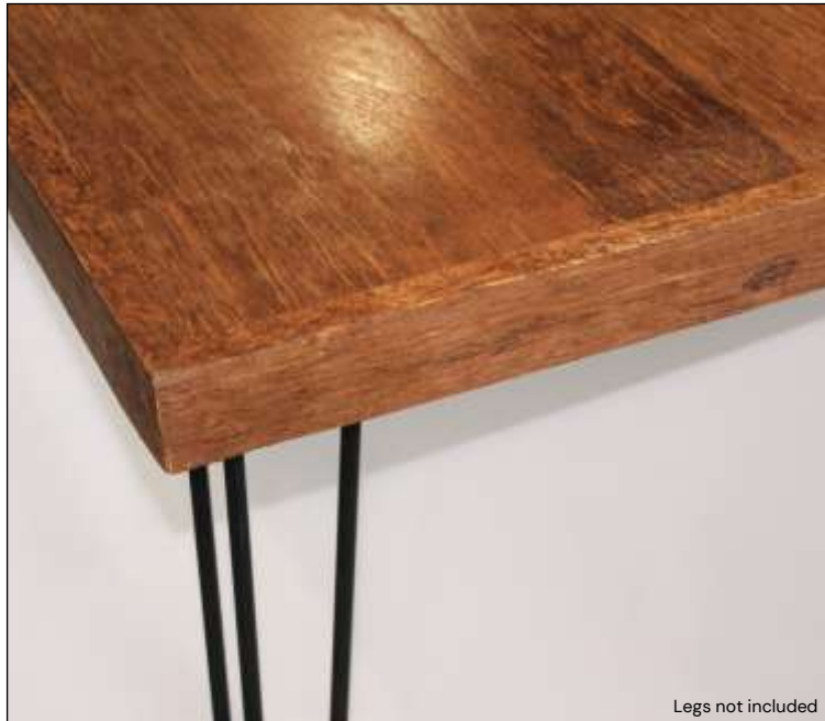
Legs not included

HempWood® Table Kits are the perfect DIY for even the most novice woodworkers. HempWood® Table Kits have detailed instructions and even a video follow-along guide on YouTube.