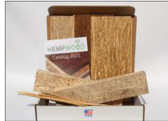
Architecture & Design Pack