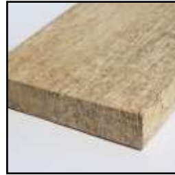
4/4 x 5.25 x 48/72" $7/linear ft.