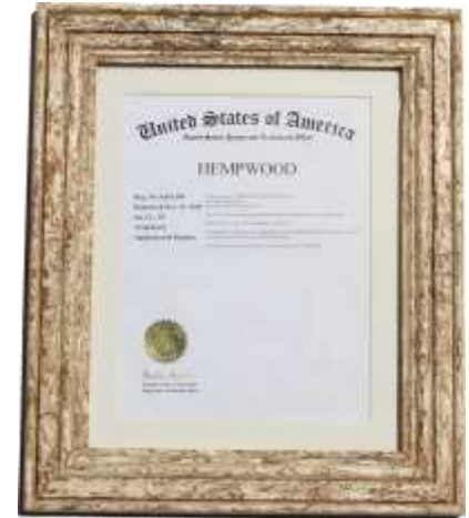
Mat Color Options