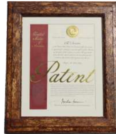
Frame Color Options